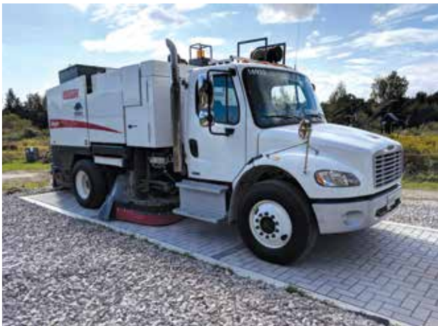
Figure 20. This type of mechanical sweeper removes sediment from joints parallel to the direction of the broom rotation.

Street Sweepers —These typically have rotating plastic bristle brushes positioned near the curb side and center pickup into a hopper at the rear. Do not use water as it slows removal of loose dirt into the machine. This machine does provide a small vacuum force to manage dust, but the cleaning action is provided by the mechanical sweeping, so it is moderately effective among large machines