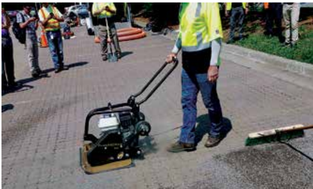
Figure 25. No matter the equipment used, after removing sediment soiled aggregate, clean aggregate is placed in the joints, the surfaced cleaned and compacted.