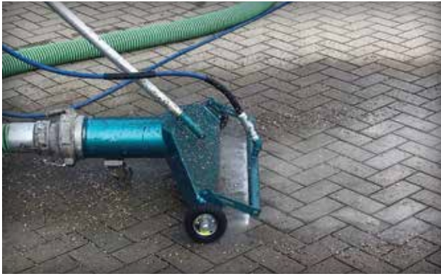
Figure 23. This equipment provides combined washing and vacuum of unmaintained PICP.