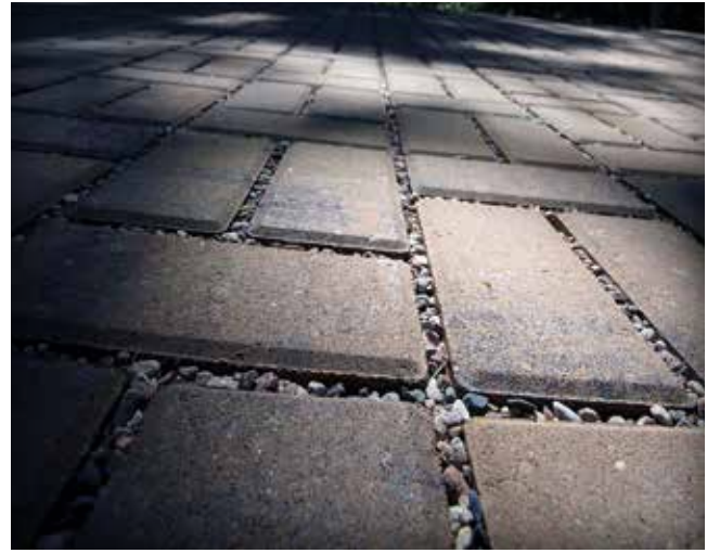
Figure 4. Keeping PICP joints filled with permeable aggregate facilitates removal of accumulated sediment.

jointing stones in the first few months is normal to PICP as open-graded aggregates for jointing and bedding choke into the larger base aggregates beneath and stabilize. This settlement often requires the joints to be refilled with aggregates three to six months after their initial installation. If possible, this should be included in the initial construction contract specifications. Aggregate-filled joints facilitate sediment removal at the surface.