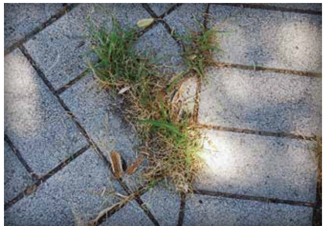
Figure 9. Weeds indicate sediment accumulation and lack of surface cleaning to remove it.

Inspect During and Just After a Rainstorm —The extent of puddles and bird baths observed during and especially after rainstorm indicate a need for surface cleaning. A minor amount of ponding is likely to occur particularly at transitions from impervious pavement surfaces to PICP. This often occurs first as sediment is transported by runoff and vehicles. See Figures 10 and 11. Should ponding areas occupy more than 20% of the entire PICP surface, then surface cleaning should be conducted. While a rainstorm's exact conclusion is difficult to predict, standing water on PICP for more than 15 minutes during or after a rainstorm likely indicates a location approaching clogging.