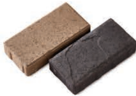
Chroma Color Protected