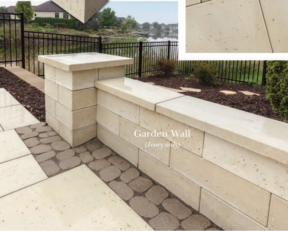
Garden Wall ( Ivory only )