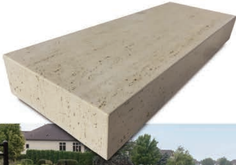
Step ( Ivory or Natural )