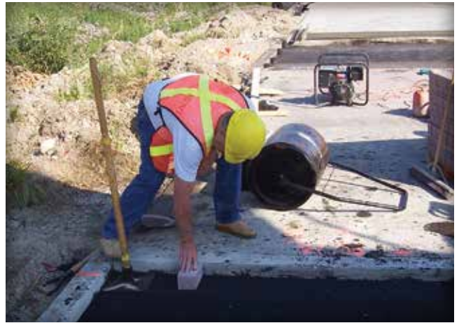
Figure 7. The compacted bedding elevation at the edge is checked with a paver.