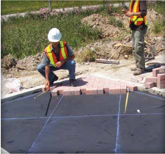
Figure 10. Cut pavers are added along the edges.

Best application results are typically achieved using a synthetic paint roller with a short nap. Once applied the tack coat should not be disturbed and should be allowed to cure before covering with the setting bed material. As the asphalt emulsion cures it should turn from a brown to black color (Figure 3). This may take a few hours depending on weather conditions. When using SS-1 and SS-1h asphalt emulsions the temperature should be between 70 and 160° F (20 to 70° C) to allow for proper curing. Asphalt tack coats are recommended for vehicular applications. They are typically not required in pedestrian applications.