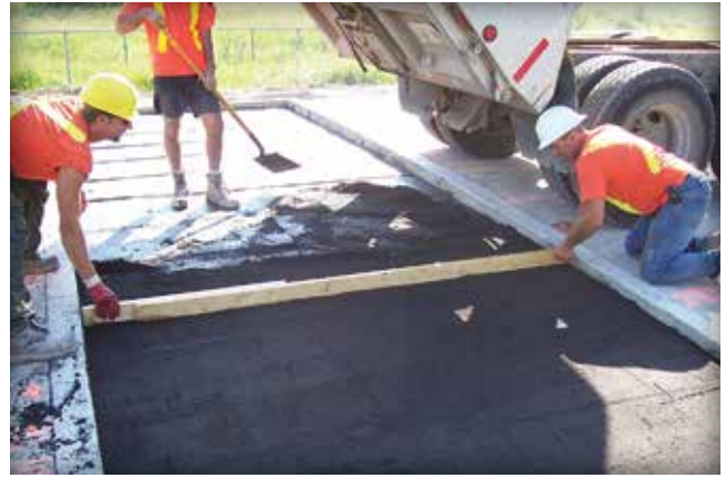
Figure 5. While the bitumen-sand is still hot, it is screeded to an uncompacted thickness of about \frac{3}{4} in. (20 mm).