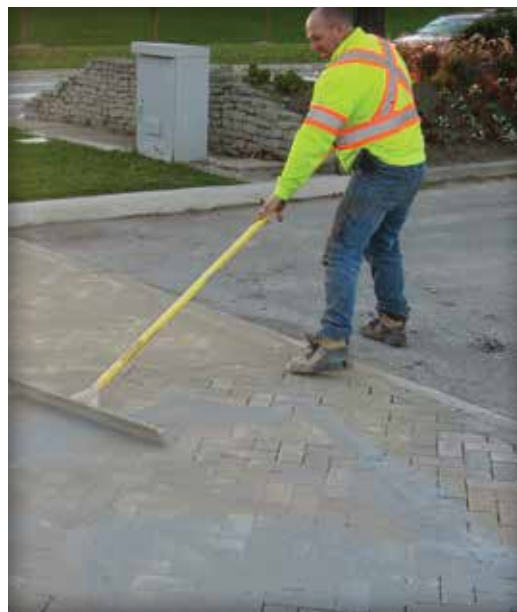
Figure 11. Sweeping in joint sand

The hot bitumen-sand bedding layer is placed, screeded to about \frac{3}{4} in. (20 mm) thick and compacted while remaining above 250° F (120° C) (Figures 4 and 5). This layer typically compacts about \frac{1}{8} in. (3 mm). The depth of this layer must be consistent. If the area does not have a curb to support a screed, screed bars are placed directly on the concrete base to guide the screed.