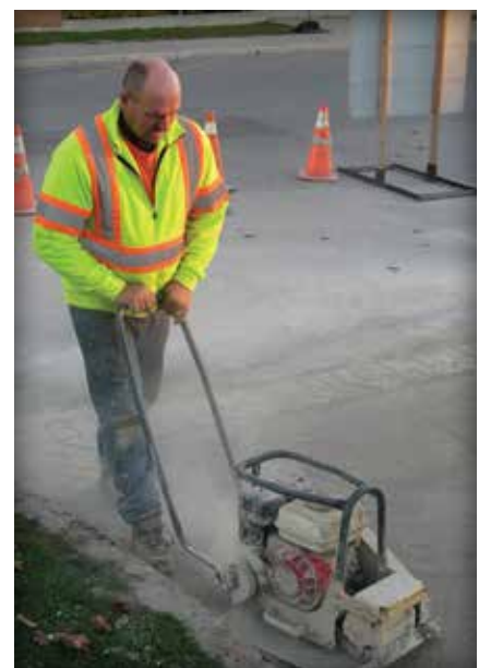
Figure 12. Once the pavers are in place, the joints are filled with dry joint sand and the surface is compacted.

A thin layer of neoprene-asphalt adhesive is then applied with a squeegee to the top of the bedding layer, and allowed to cure (typically 1 to 2 hours). Adhesives with a high viscosity are applied with a straight edged towel as shown in Figure 8. Adhesives with a low viscosity can be applied with a squeegee. The adhesive takes a hazy appearance when ready to mark baselines and place the concrete pavers (Figure 9). Only enough adhesive should be applied that will be covered with pavers in a day's work. Figure 10 shows the paver installation. Once the pavers are placed on the adhesive, they are very difficult to remove. If removed, they can pull up the adhesive and bitumen-sand bedding under the paver. Once all the pav-