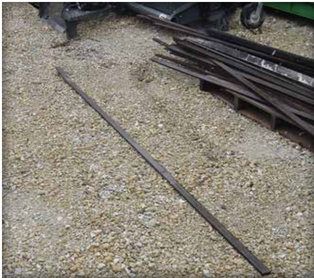
Figure 17. On larger projects, 1/2 in. (13 mm) thick steel screed bars are placed on the concrete base to ensure a uniform bitumen-sand bedding thickness.