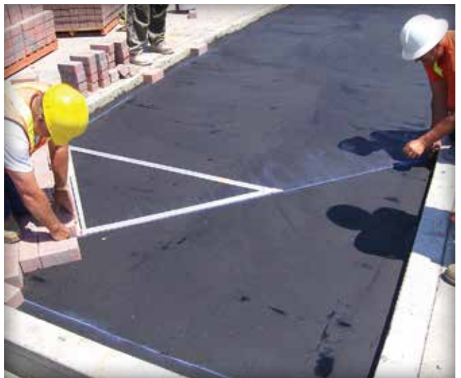
Figure 9. Perpendicular chalk lines are snapped and the pavers placed on the adhesive after the neoprene-asphalt adhesive dries (cloudy black surface).