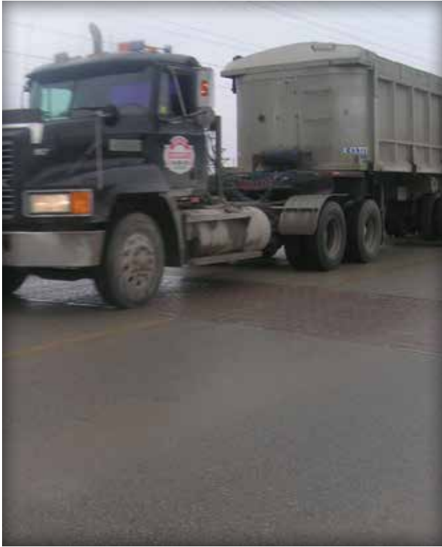
Figure 13. Crosswalk in use under heavy traffic.

ers are in place including cut units, sand is swept into the joints and pavers are compacted until the joints are full (Figures 11 and 12). For more efficient work, sand sweeping and compaction can be simultaneous. Unlike sand-set pavers, there is no need to compact the pavers without sand in the joints first. When completed, the pavement can accept traffic loading immediately (Figure 13).