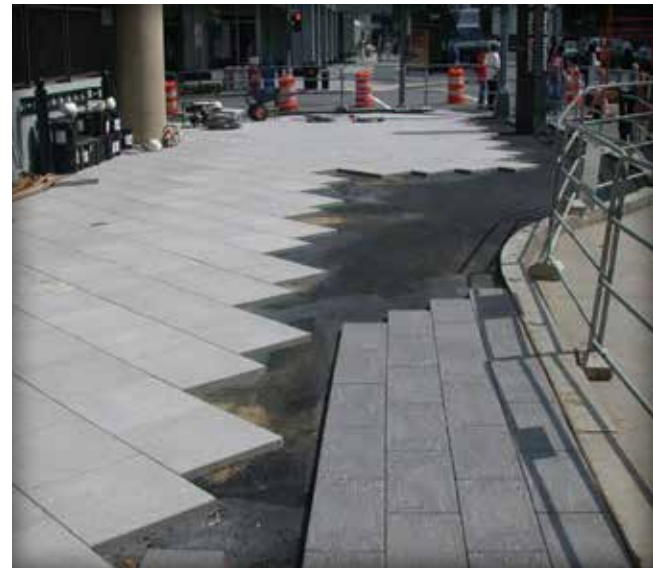
Figure 18. Paving slabs adhered to a bitumen-sand bedding in a Washington, DC, sidewalk.