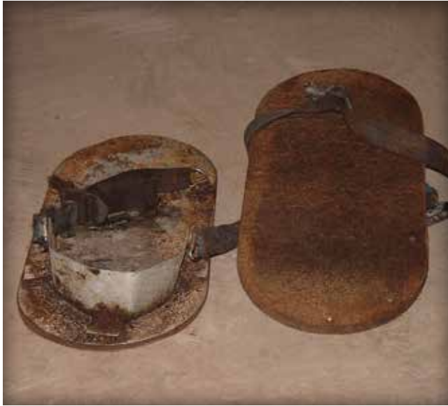
Figure 15. Walking on the hot bitumen-sand bedding with regular construction grade, steel-toed boots is discouraged. For limited walking on this layer, workers should wear boot sole covers shown here that resist damage and better distribute weight to prevent dentations.