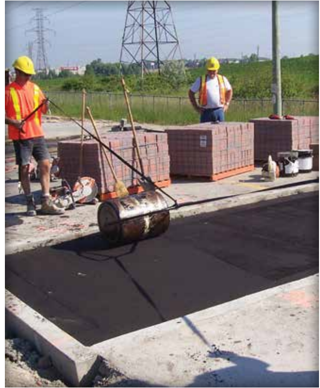
Figure 14. A water-filled roller compactor for compacting the bitumen-sand bedding.

Specialty Tools —Some specialty tools are required to successfully install bitumen-sand set pavers. For example, Figure 14 shows a roller modified with a long handle welded or bolted to the frame. The drum of the roller should be smooth with no rust, preferably with sharp edges (not rounded). Other specialty tools are shown in Figures 15, 16 and 17.