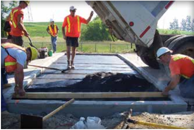
Figure 4. The hot bitumen-sand bedding material is dumped from a truck onto the concrete base.