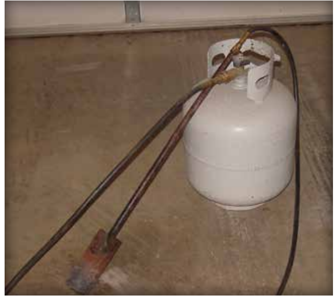
Figure 16. Occasionally, uneven bedding surface occurs and it is necessary to re-heat the bitumen-sand bedding with a propane heater tool.