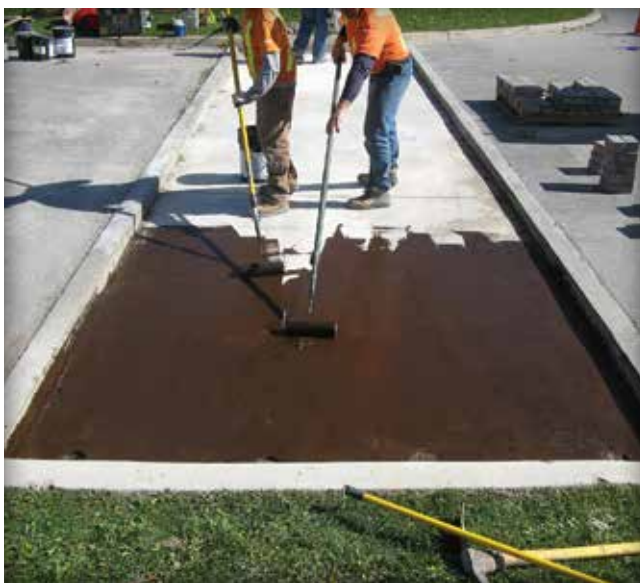
Figure 2. Emulsified asphalt tack coat is applied to a concrete base prior to applying the bitumen-sand mix.