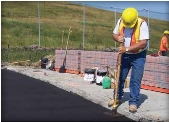
Figure 6. A hand tamper is used to compact in areas that cannot be reached with the roller compactor.