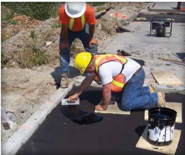
Figure 8. After the bitumen-sand mix cools, a 2% neoprene-asphalt adhesive is applied. The material can be trowel-applied as shown here. Adhesives with a lower viscosity can be spread with a squeegee.