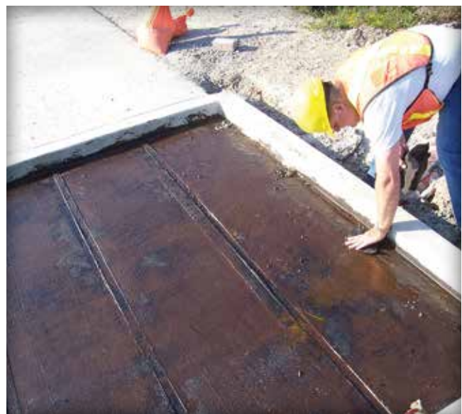
Figure 3. Confirming the tack coat has cured and is no longer wet to the touch.