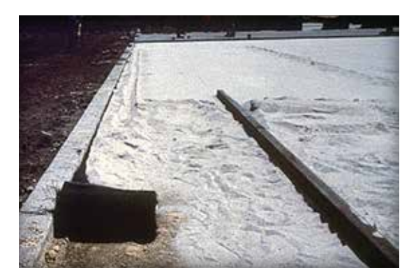
Figure 7. Woven geotextile used to contain bedding sand from migrating laterally. Visit www.icpi.org for detail drawings.

Interlocking concrete pavements should also be designed and constructed such that the bedding sand should not be able to migrate into the base, or laterally through the edge restraints. Dense-graded base aggregates with 5% to 12% fines (the amount passing the No. 200 or 0.075 mm sieve), will ensure that the bedding sand does not migrate down into the base surface. For pavements built over asphalt or con-