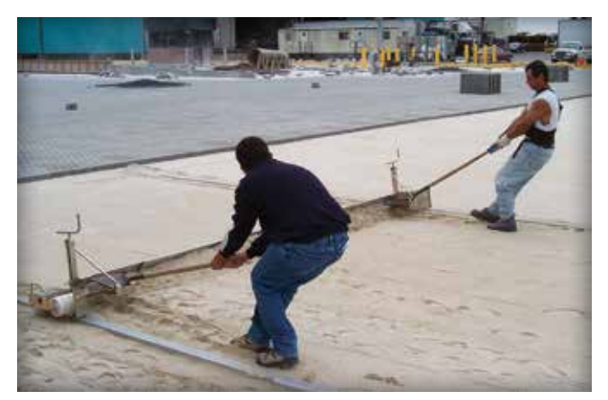
Figure 4. A two-man hand pulled screed

Role of Bedding Sand in Construction —Provided that the base was installed according to recommended construction practices and tolerances (See ICPI Tech Spec 2—Construction of Interlocking Concrete Pavements ), the bedding sand ensures that the pavers have a uniform slope and meet surface tolerances without surface undulations or "waviness."