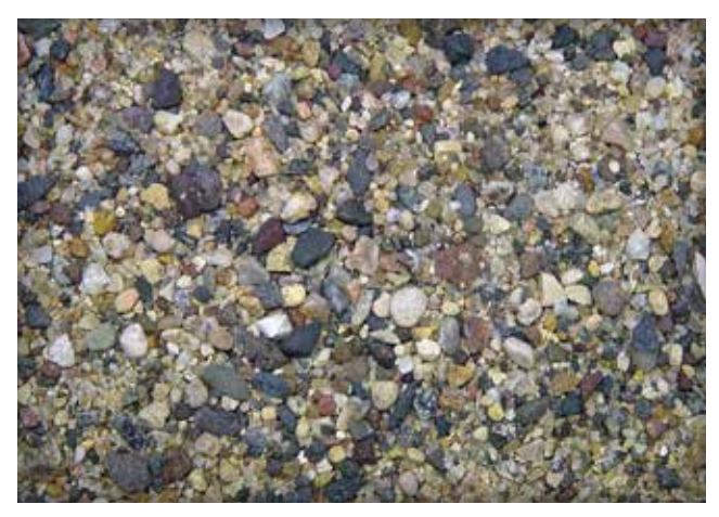
Figure 3. Example of sand from the ICPI bedding sand test program with a total combined percentage of sub-angular and sub-rounded particles equal to 65% according to ASTM D2488

Recommended Material Properties—Table 3 lists the primary and secondary material properties that should be considered when selecting bedding sands for vehicular applications. Bedding sands may exceed the gradation requirement for the maximum amount passing the No. 200 (0.075 mm) sieve as long as the sand meets degradation and permeability recommendations in Table 3. Micro-Deval degradation testing can be replaced with sodium sulfate or magnesium soundness testing as long as this test is accompanied by the other primary material property tests listed in Table 3. Other material properties listed, such as petrography and angularity testing are at the discretion of the specifier and may offer additional insight into bedding sand performance.