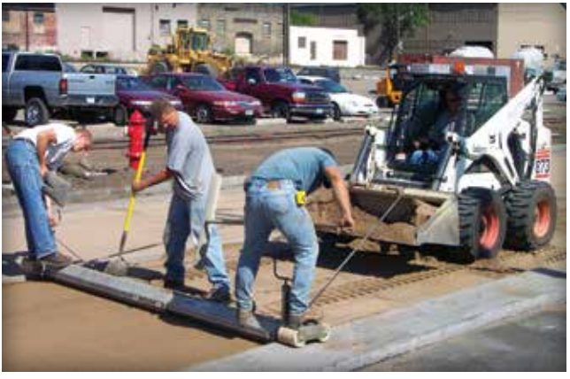
Figure 5. Mechanical screeding is the most efficient method of bedding sand installation

The sand should have sufficient moisture content to allow for adequate compaction. At no times should bedding sand be either "bone dry" or saturated. A moisture content range of 6% to 8% has been shown to be optimal for most sands (Beaty 1992). Contractors can assess moisture content by squeezing a handful of sand in their hand. Sand at optimal moisture content will hold together when the hand is re-opened without shedding excess water. Although it can be