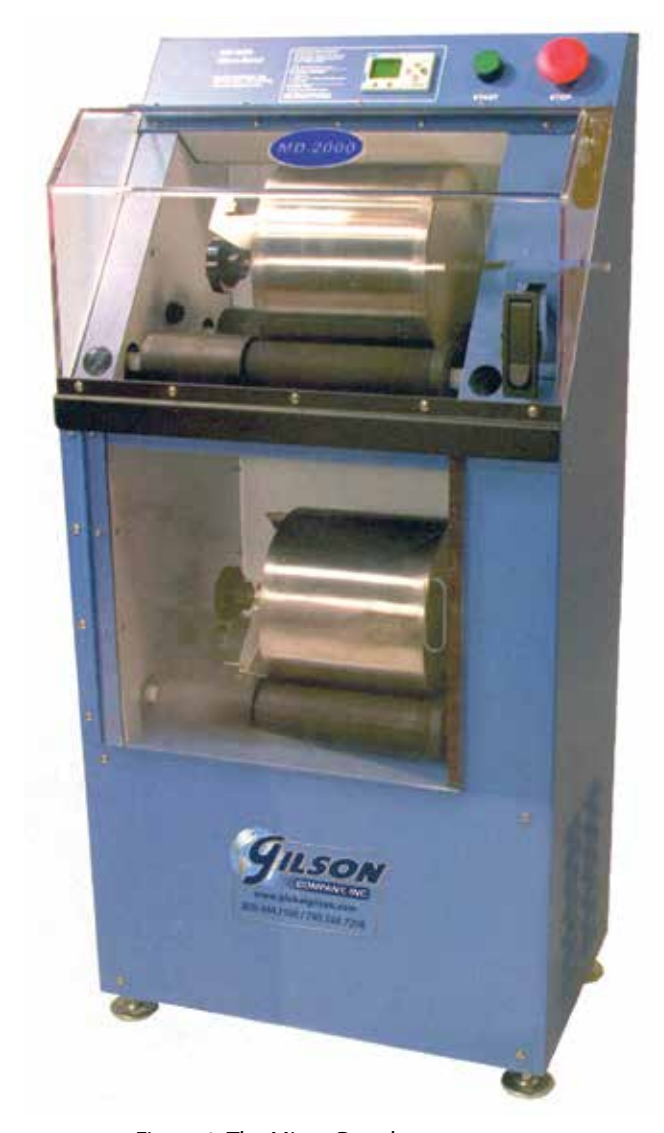
Figure 1. The Micro-Deval test apparatus.

Failure of the bedding sand layer occurs in channelized vehicular loads from two main actions; structural failure through degradation and saturation due to inadequate drainage. Since bedding sands are located high in the pavement structure, they are subjected to repeated applications of high stress from the passage of vehicles over the pavement (Beaty 1996). This repeated action, particularly from higher bus and truck axle loads, will degrade the bedding