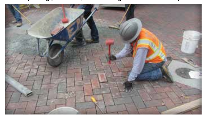
Figure 5. The final paver is inserted, the reinstated area compacted, joints filled, and compacted again. There are not cuts or damage to the pavement surface.