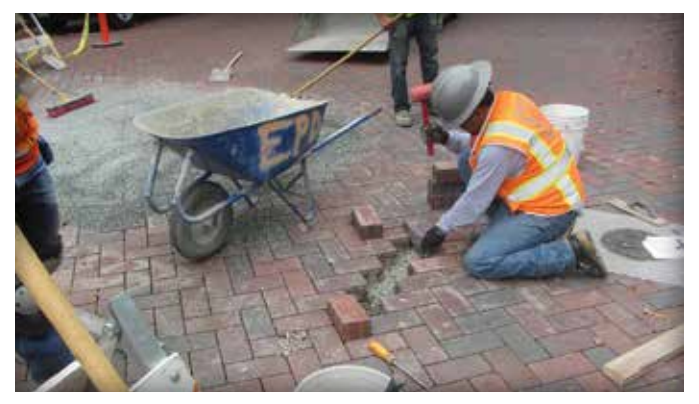
Figure 4. Reinstatment using the same pavers continues following the existing herringbone paving pattern.

Number of years of life Annual cost Annual cost of Annual cost remaining before of resurfacing of resurfacing pavement damage from utility cuts to one = resurfacing streets streets damaged streets damaged with utility cuts category of streets by utility cuts by utility cuts (local, collector Expected years of life thoroughfare, etc.) before resurfacing if there are no utility cuts