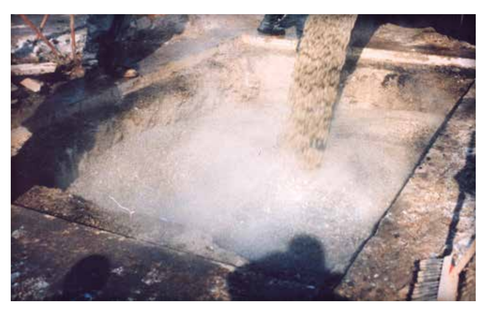
Figure 8. Low density concrete fill (unshrinkable fill) poured into a utility trench from a ready-mix concrete truck.

reinstated units are knitted into existing ones through the interlocking paving pattern and sand filled joints. Besides providing a pavement surface without cuts, the joints distribute loads by shear transfer. The joints allow minor settlement in the pavers caused by discontinuities in the base or soil without cracking.