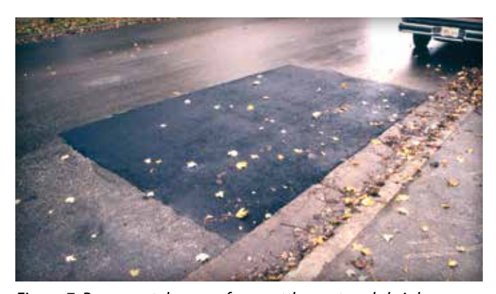
Figure 7. Pavement damage from settlement and shrinkage of cold patch asphalt.

Figures 2, 3, 4, 5 and 6 show the process of repair and illustrate the continuity of the paver surface after it is completed. The