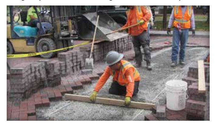
Figure 2. After compaction of the base, bedding material is screeded.

The cost of pavement damage includes street resurfacing and rehabilitation to remedy damage from cuts. Permit fees charged by cities to those making cuts often do not fully account