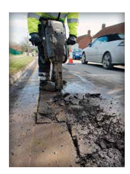
Figure 1. Repairs to utilities are a common sight in cities, incurring costs to cities and taxpayers.

The report concludes that while San Francisco has some of the highest standards for trench restoration, utility cuts produce damage that extends beyond the immediate trench. "...even the highest restoration standards do not remedy all the damage. Utility cuts cause the soil around the cut to be disturbed, cause the backfilled soil to be compacted to a different degree than the soil around the cut, and produce discontinuities in the soil and wearing