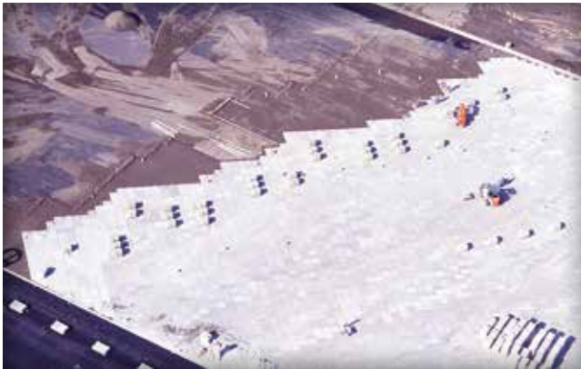
Figure 7. Maintaining an angular laying face that resembles a saw-tooth pattern facilitates installation of paver clusters.

Variations in the surface of the base must be repaired prior to installation of the bedding sand. The screeded bedding course should not be exposed to foot or vehicular traffic. Fill voids created by removal of screed rails or other equipment with sand as the bedding proceeds. The screeded bedding sand course should not be damaged prior to installation of the pavers. Types of damage can include saturation, displacement, segregation or consolidation. The sand may require replacement should these types of damage occur.