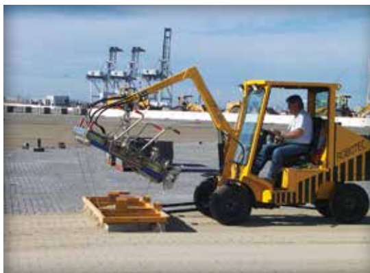
Figure 12. Sweeping jointing sand across the pavers is done after the initial compaction of the concrete pavers.

Joint sand should be spread on the surface of the pavers in a dry state. If it is damp, it can be allowed to dry before