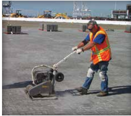
Figure 10. Initial compaction sets the concrete pavers into the bedding sand.