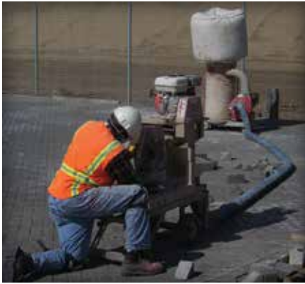
Figure 9. Edge pavers are saw cut to fit against a drainage inlet.