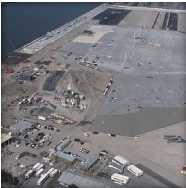
Figure 14. The Port of Oakland, California, is the largest mechanically installed project in the western hemisphere at 4.7 million sf (470,000 m 2 ).