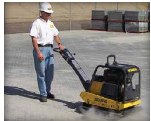
Figure 13. Final compaction should consolidate the sand in the joints of the concrete pavers.