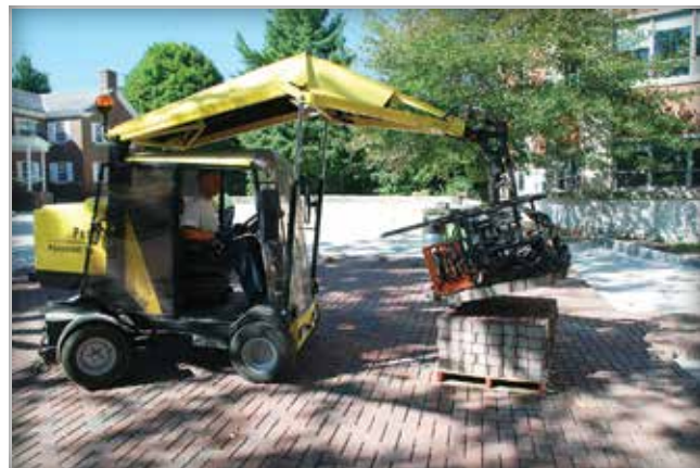
Figure 1. Mechanical installation of interlocking concrete pavements (left) and permeable units (right) is seeing increased use in industrial, port, and commercial paving projects to increase efficiency and safety.