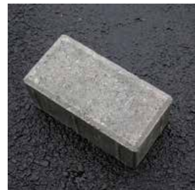
Figure 4. Spacer bars are small nibs on the sides of the pavers that provide a minimum joint spacing into which joint sand can enter.

A key aspect of this guide specification is dimensional tolerances of concrete pavers. For length and width tolerances, ASTM C 936 allows \pm 1/16 in. ( \pm 1.6 mm) and CSA A231.2 allows \pm 2 mm. These are intended for manual installation and should be reduced to \pm 1.0 mm (i.e., \pm 0.5 mm for each side of the paver) for mechanically installed pavers, excluding spacer bars. Height should not exceed