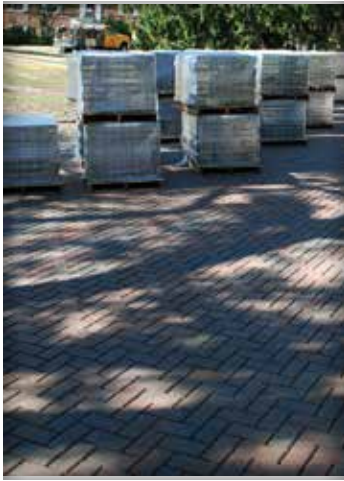
Figure 2. Bundles of ready-to-install pavers for setting by mechanical equipment. Bundles are often called cubes of pavers.

information on design and construction with this paving method. Other references include American Society for Testing and Materials or the Canadian Standards Association for the concrete pavers, sands, and joint stabilization materials, if specified. Placement of the base, drainage and related earthwork should be detailed in another specification section and may be performed by another subcontractor or the GC.