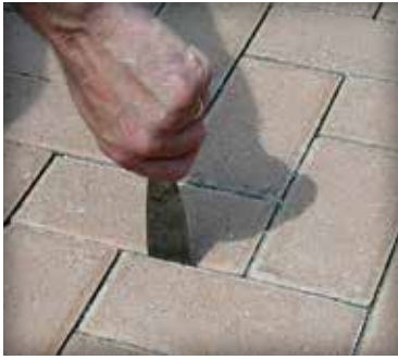
Figure 14. A simple test with a putty knife checks consolidation of the joint sand.

sweeping and vibration so it can enter the joints readily. Vibrate and fill joints with sand to within 6 ft. (2 m) of any unconfined edge at the end of each day.