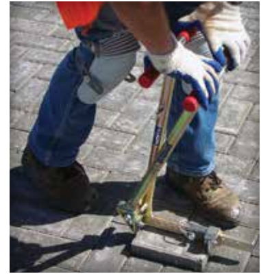
Figure 11. During initial compaction, cracked pavers are removed and immediately replaced with whole units.

Different laying and cluster patterns are shown in Figure 8. The need to maximize interlock among clusters with stitching depends on expected vehicular loads. For lower load applications, stitching may not be needed. In some cases stitching is done more for aesthetic reasons. For higher load applications, herringbone patterns or stitching clusters together may be required. The cluster configuration pattern and stitching (if required) should be illustrated in the method statement in the Quality Control Plan. As paving proceeds, hand install a string course of pavers around all obstructions such as concrete collars, catch basins/drains, utility boxes, foundations and slabs.