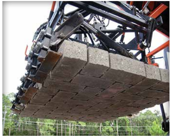
Figure 3. A cluster of pavers (or layer) is grabbed for placement by mechanical installation equipment. The pavers within the cluster are arranged in the final laying pattern as shown under the equipment.