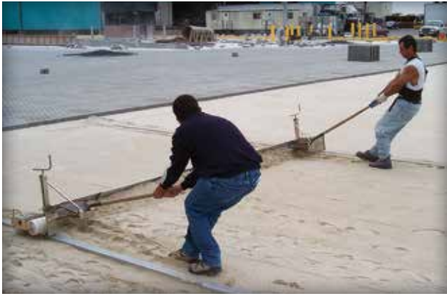
Figure 4. A two-man hand pulled screed