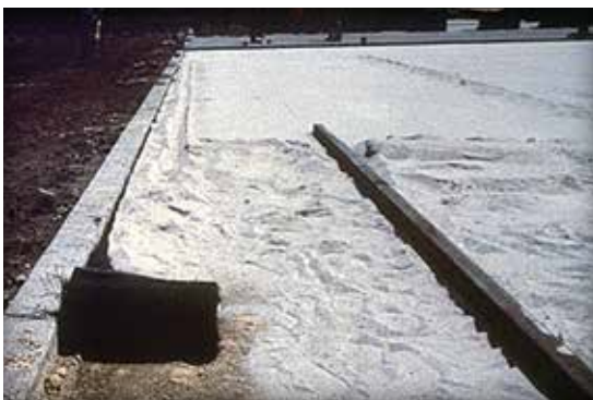
Figure 7. Woven geotextile used to contain bedding sand from migrating laterally. Visit www.icpi.org for detail drawings.

Interlocking concrete pavements should also be designed and constructed such that the bedding sand should not be able to migrate into the base, or laterally through the edge restraints. Dense-graded base aggregates with 5% to 12% fines (the amount passing the No. 200 or 0.075 mm sieve), will ensure that the bedding sand does not migrate down into the base surface. For pavements built over asphalt or con-