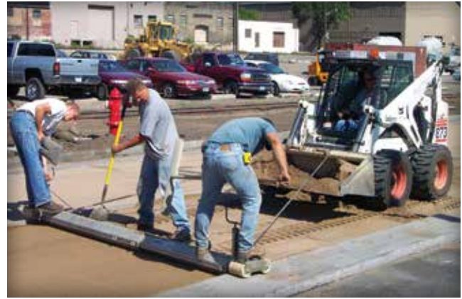
Figure 5. Mechanical screeding is the most efficient method of bedding sand installation

Role of Bedding Sand in Construction —Provided that the base was installed according to recommended construction practices and tolerances (See ICPI Tech Spec 2—Construction of Interlocking Concrete Pavements ), the bedding sand ensures that the pavers have a uniform slope and meet surface tolerances without surface undulations or “waviness.”