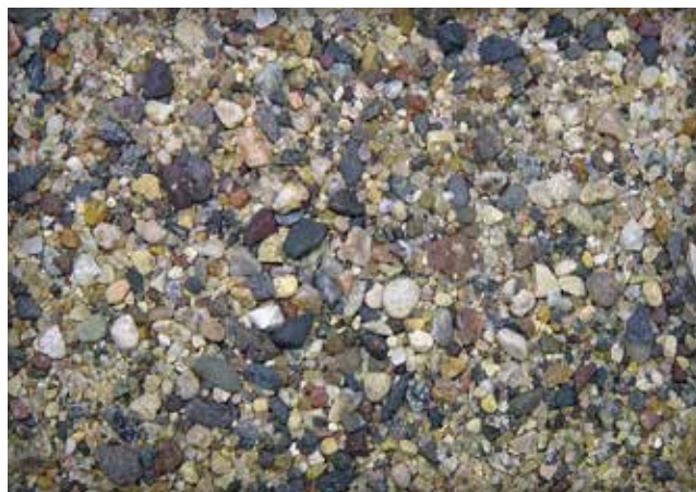
Figure 3. Example of sand from the ICPI bedding sand test program with a total combined percentage of sub-angular and sub-rounded particles equal to 65% according to ASTM D2488

Recommended Material Properties —Table 3 lists the primary and secondary material properties that should be considered when selecting bedding sands for vehicular applications. Bedding sands may exceed the gradation requirement for the maximum amount passing the No. 200 (0.075 mm) sieve as long as the sand meets degradation and permeability recommendations in Table 3. Micro-Deval degradation testing can be replaced with sodium sulfate or magnesium soundness testing as long as this test is accompanied by the other primary material property tests listed in Table 3. Other material properties listed, such as petrography and angularity testing are at the discretion of the specifier and may offer additional insight into bedding sand performance.