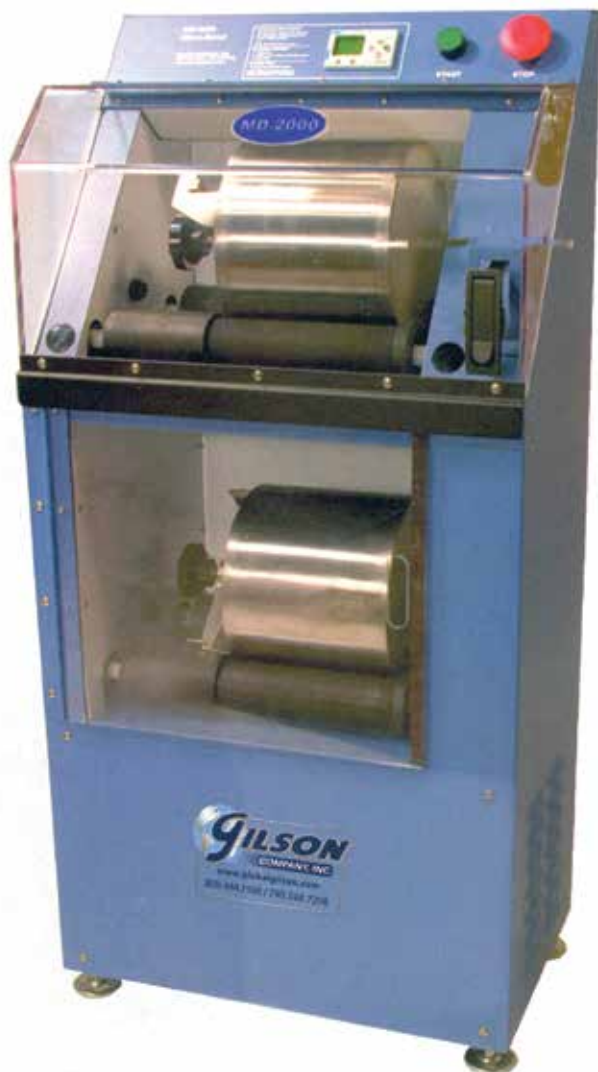
Figure 1. The Micro-Deval test apparatus.

The Micro-Deval test is evolving as the test method of choice for evaluating durability of aggregates in North America. Defined by CSA A23.2-23A, The Resistance of Fine Aggregate to Degradation by Abrasion in the Micro-Deval Apparatus (CSA 2004) and ASTM D 7428-08 Standard Test Method for Resistance of Fine Aggregate to Degradation by Abrasion in the Micro-Deval Apparatus , the test method involves subjecting aggregates to abrasive action from steel balls in a laboratory rolling jar mill. In the CSA test method a 1.1 lb (500 g) representative sample is obtained after washing to remove the No. 200 (0.080 mm) material. The sample is saturated for 24 hours and placed in the Micro-Deval stainless steel jar with 2.75 lb (1250 g) of steel balls and 750 mL of tap water (See Figure 1). The jar is rotated at 100 rotations per minute for 15 minutes. The sand is separated from the steel balls over a sieve and the sample of sand is then washed over an 80 micron (No. 200) sieve. The material retained on the 80 micron