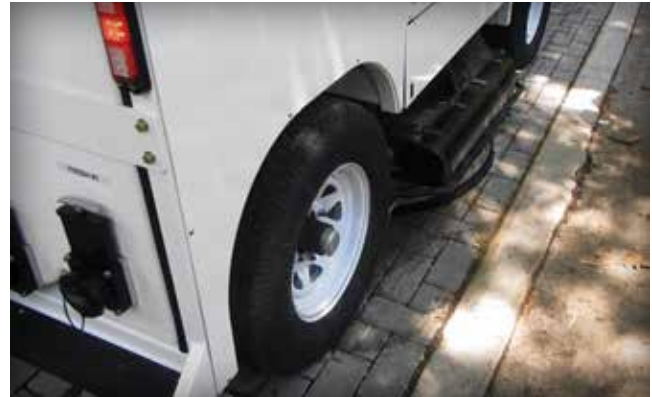
Figure 23. Equipment that provides combined power washing and vacuum