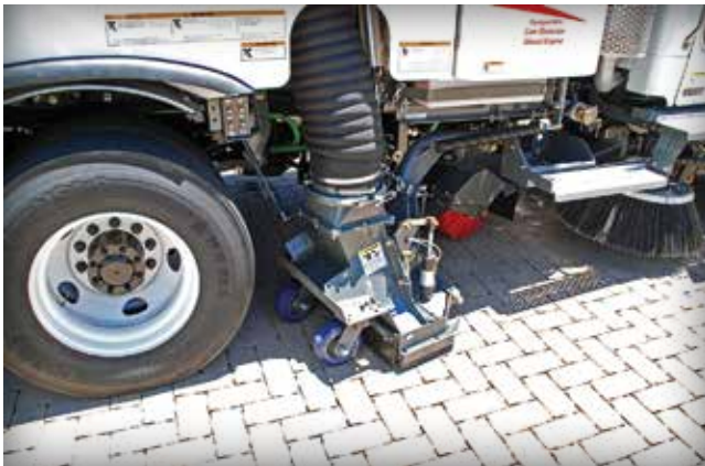
Figure 22. A true vacuum machine cleaning neglected PICP.