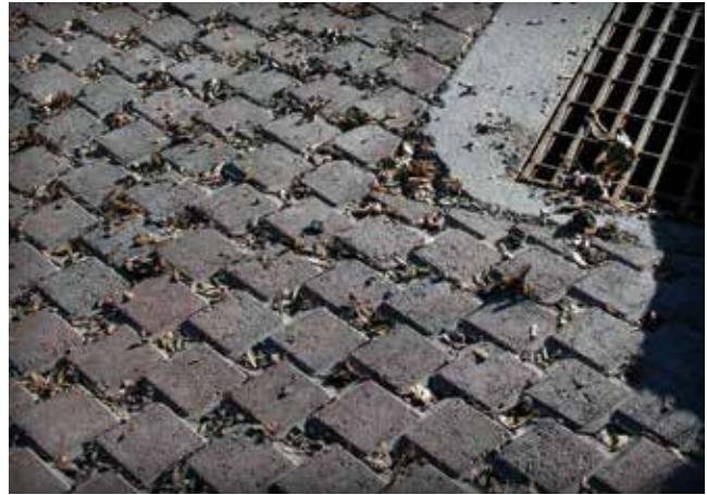
Figures 7 and 8. Pine needles and leaves eventually will degrade and get compacted into the joints from traffic. They should be removed by sweeping or vacuuming before that happens.

surface helps maintain infiltration. Figure 5 illustrates an example of correct management of landscaping material on PICP, as well as the need to exposed soil slopes.