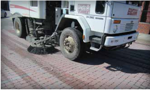
Figure 21. A regenerative air machine cleaning a PICP parking lot.