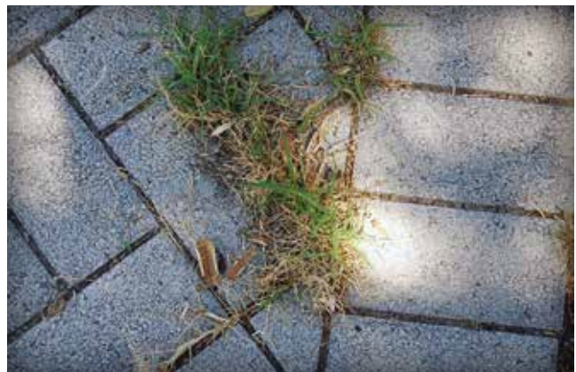
Figure 9. Weeds indicate sediment accumulation and lack of surface cleaning to remove it.

Inspect During and Just After a Rainstorm —The extent of puddles and bird baths observed during and especially after rainstorm indicate a need for surface cleaning. A minor amount of ponding is likely to occur particularly at transitions from impervious pavement surfaces to PICP. This often occurs first as sediment is transported by runoff and vehicles. See Figures 10 and 11. Should ponding areas occupy more than 20% of the entire PICP surface, then surface cleaning should be conducted. While a rainstorm's exact conclusion is difficult to predict, standing water on PICP for more than 15 minutes during or after a rainstorm likely indicates a location approaching clogging.