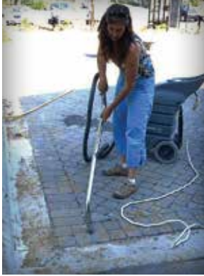
Figure 17. Wet/dry shop vacuum cleans loose sediment from a PICP residential driveway