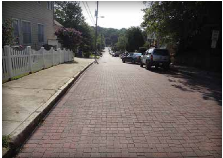
Figure 1. PICP is seeing increased use in municipal streets to reduce stormwater runoff, local flooding, storm pipe upsizing, and combined sewer overflows. These streets are in Atlanta, GA.