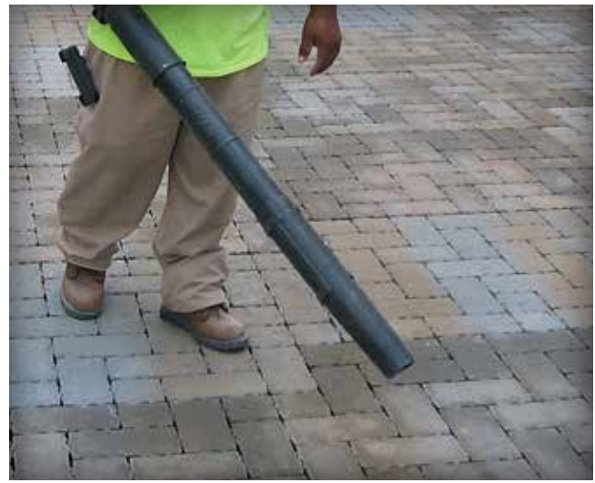
Figure 15. Blowing debris to curbs or gutters for removal and disposal.