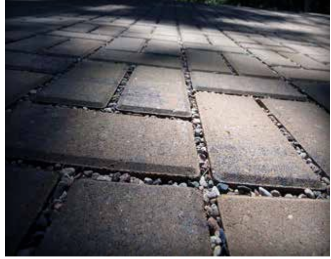
Figure 4. Keeping PICP joints filled with permeable aggregate facilitates removal of accumulated sediment.

jointing stones in the first few months is normal to PICP as open-graded aggregates for jointing and bedding choke into the larger base aggregates beneath and stabilize. This settlement often requires the joints to be refilled with aggregates three to six months after their initial installation. If possible, this should be included in the initial construction contract specifications. Aggregate-filled joints facilitate sediment removal at the surface.