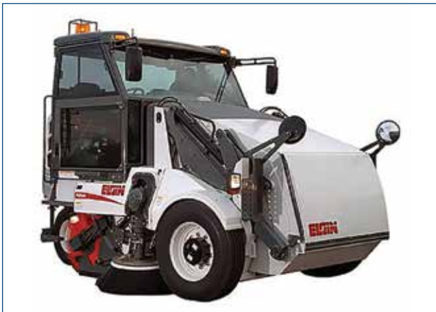
Figure 20. Mechanical sweepers use no vacuum making them the least effective of large cleaning machines.

Regenerative Air Sweepers —Includes a box positioned under the truck and on the pavement through which air is blown and recirculated (hence the term regenerative air). The pavement must have no convex (or reverse) crown in order to create an adequate seal for suction in the box. Air pressure flowing through it picks up loose debris and sediment. Rotating brushes can be used to direct dirt and debris toward the box. Approximate cost: $100 to $120 per hour from a service company. Used by some municipalities. See Figure 21.