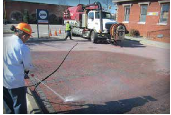
Figure 19. Power washing requires a little practice to minimize jointing stone removal.

will be required. Power washing alone generally is not an optimal cleaning approach because there is almost no opportunity on most sites to remove the water-suspended sediment before the water is absorbed back into the pavement. Approximate cost: $125 to $1500 (Figure 19).