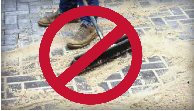
Figure 2. Sand-filled joints and bedding common to interlocking concrete pavement are not used in PICP.

Every PICP site varies in sediment deposition onto its surface, particle size distribution, and the resulting cleaning frequency. For example, beach sand (a coarse particle size distribution) on the surface will not clog as quickly and require less effort removing than fine clay sediment. Besides the particle size distribution, the rate of surface infiltration decline also depends on the traffic, size, and slope of a contributing impervious area, adjacent vegetation and eroding soil, paver joint widths and jointing stone sizes. ICPI offers a PICP site selection tool on www.icpi.org/resource-library/software-programs to help identify favorable sites and avoid one that may incur additional maintenance.