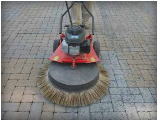
Figure 16. Rotary brushes increase cleaning efficiencies.