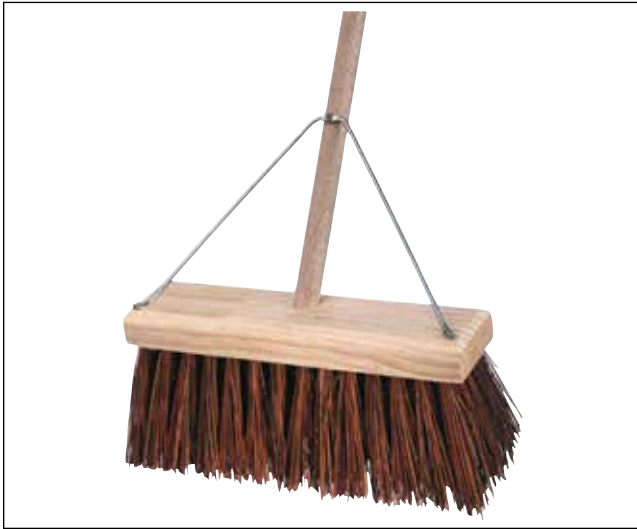
Figure 14. Bristle broom for removing loose debris