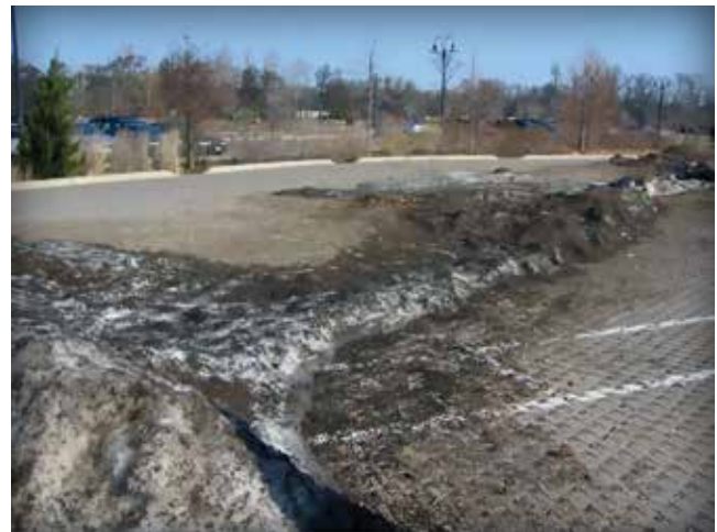
Figure 24. This is an example of snow that should have been deposited on a grassy area. If such areas are not available, then vacuum clean the PICP in the early spring.

Deicers —When used sparingly, deicers should not damage PICP surfaces as the brine typically forms on the surface to lower the freezing temperature of water and eventually moves into the joints with melting ice or snow. Some deicers will accelerate surface wear on some styles of pavers with blasted or hammered surfaces. Sealers may help reduce the risk of damage.