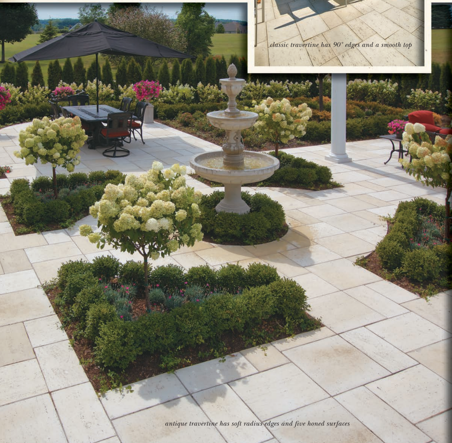
antique travertine has soft radius edges and five honed surfaces