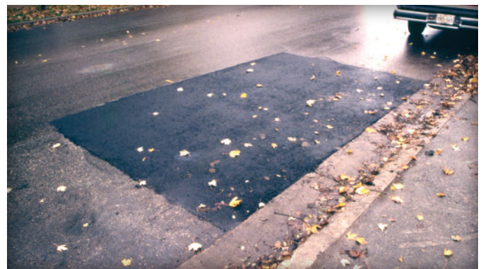
Figure 7. Pavement damage from settlement and shrinkage of cold patch asphalt.

Concrete pavers , if being replaced, should be at least 3.125 in. (80 mm) thick and meet ASTM C936 or CSA A231.2. They should be delivered in strapped bundles and placed around