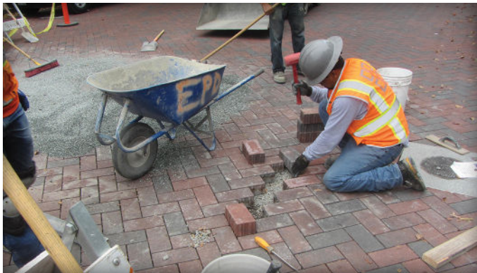
Figure 4. Reinstatement using the same pavers continues following the existing herringbone paving pattern.