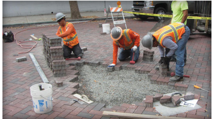
Figure 3. Once smoothed and joined with undisturbed materials at the opening perimeter, the bedding receives concrete pavers.