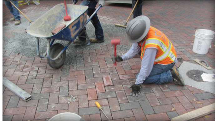
Figure 5. The final paver is inserted, the reinstated area compacted, joints filled, and compacted again. There are not cuts or damage to the pavement surface.

the pavers caused by discontinuities in the base or soil without cracking.