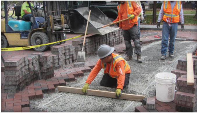
Figure 2. After compaction of the base, bedding material is screeded. Edge restraints would typically be required to prevent the pavers from moving during disassembly and reinstatement.