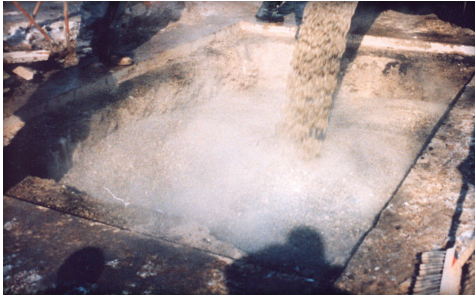
Figure 8. Low density concrete fill (unshrinkable fill) poured into a utility trench from a ready-mix concrete truck.

the opening in locations that don't interfere with excavation equipment or ready-mix trucks. The bundles should be covered with plastic to prevent water from freezing them together. The bundles need to be placed in locations close to the edge of the opening. Most bundles have several rows or bands of pavers strapped together. These are typically removed with a paver cart. The paver bundles should be oriented so that transport with carts is done away from the edge of the pavement opening.