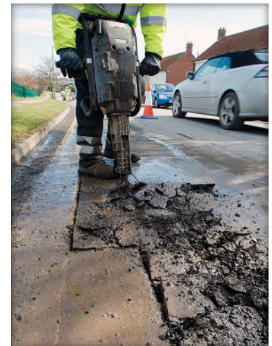
Figure 1. Repairs to utilities are a common sight in cities, incurring costs to cities and taxpayers.

The report concludes that while San Francisco has some of the highest standards for trench restoration, utility cuts produce damage that