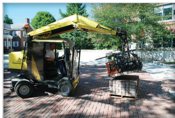
Figure 1. Mechanical installation of interlocking concrete pavements (left) and permeable units (right) is seeing increased use in industrial, port, and commercial paving projects to increase efficiency and safety.