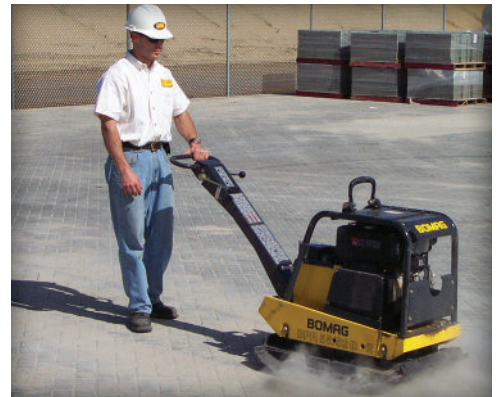
Figure 13. Final compaction should consolidate the sand in the joints of the concrete pavers.