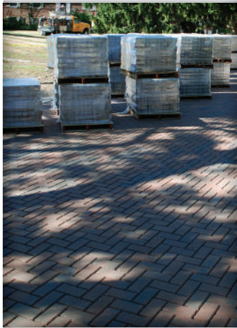
Figure 2. Bundles of ready-to-install pavers for setting by mechanical equipment. Bundles are often called cubes of pavers.