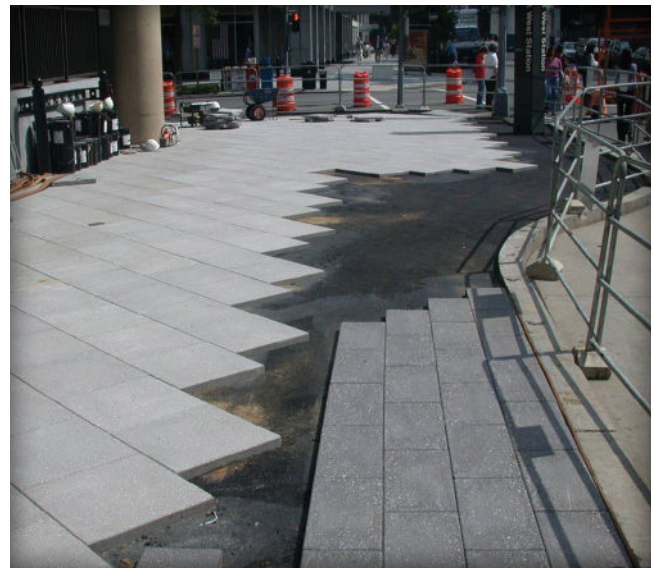
Figure 18. Paving slabs adhered to a bitumen-sand bedding in a Washington, DC, sidewalk.