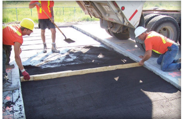
Figure 5. While the bitumen-sand is still hot, it is screeded to an uncompacted thickness of about 3/4 in. (20 mm).