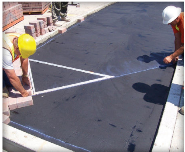
Figure 9. Perpendicular chalk lines are snapped and the pavers placed on the adhesive after the neoprene-asphalt adhesive dries (cloudy black surface).