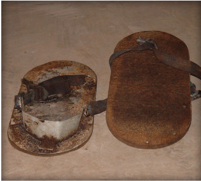
Figure 15. Walking on the hot bitumen-sand bedding with regular construction grade, steel-toed boots is discouraged. For limited walking on this layer, workers should wear boot sole covers shown here that resist damage and better distribute weight to prevent dentations.