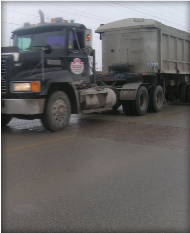
Figure 13. Crosswalk in use under heavy traffic.