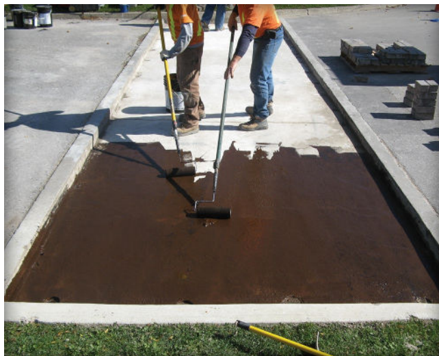
Figure 2. Emulsified asphalt tack coat is applied to a concrete base prior to applying the bitumen-sand mix.