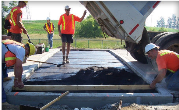
Figure 4. The hot bitumen-sand bedding material is dumped from a truck onto the concrete base.