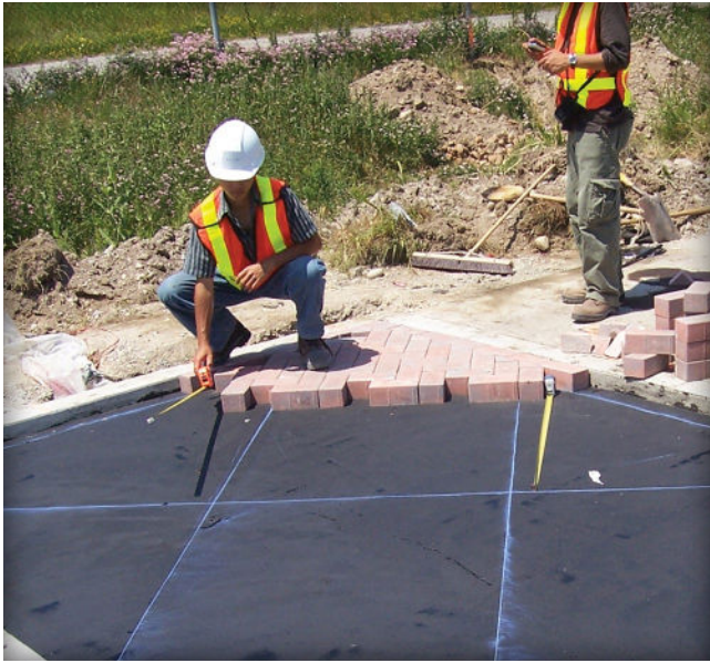
Figure 10. Cut pavers are added along the edges.

Best application results are typically achieved using a synthetic paint roller with a short nap. Once applied the tack coat should not be disturbed and should be allowed to cure before covering with the setting bed material. As the asphalt emulsion cures it should turn from a brown to black color (Figure 3). This may take a few hours depending on weather conditions. When using SS-1 and SS-1h asphalt emulsions the temperature should be between 70 and 160° F (20 to 70° C) to allow for proper curing. Asphalt tack coats are recommended for vehicular applications. They are typically not required in pedestrian applications.