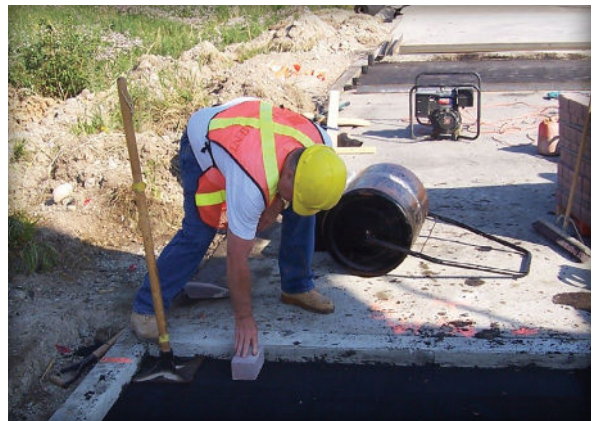
Figure 7. The compacted bedding elevation at the edge is checked with a paver.