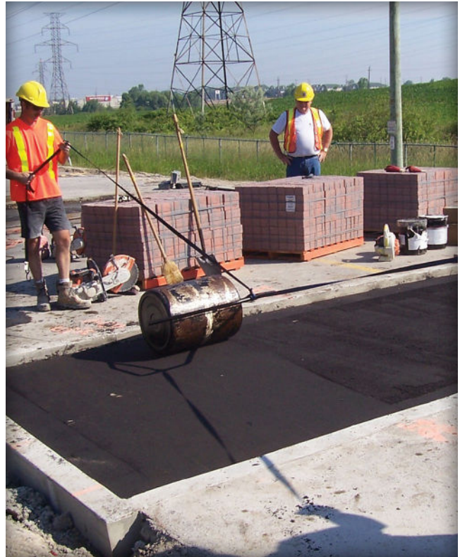
Figure 14. A water-filled roller compactor for compacting the bitumen-sand bedding.

installed bitumen-sand set pavers is practically impossible because the bitumen-sand material adheres to the bottom of the pavers when removed. It is less expensive to discard the pavers rather than remove the asphalt from the units and attempt to reinstate them.