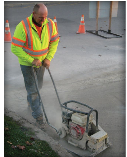
Figure 12. Once the pavers are in place, the joints are filled with dry joint sand and the surface is compacted.