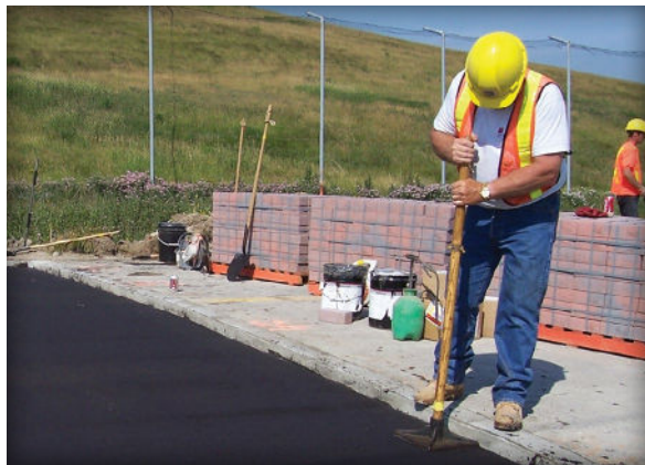
Figure 6. A hand tamper is used to compact in areas that cannot be reached with the roller compactor.