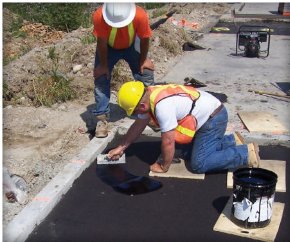
Figure 8. After the bitumen-sand mix cools, a 2% neoprene-asphalt adhesive is applied. The material can be trowel-applied as shown here. Adhesives with a lower viscosity can be spread with a squeegee.