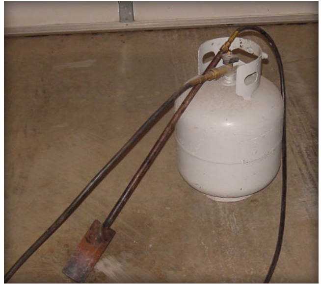
Figure 16. Occasionally, uneven bedding surface occurs and it is necessary to re-heat the bitumen-sand bedding with a propane heater tool.