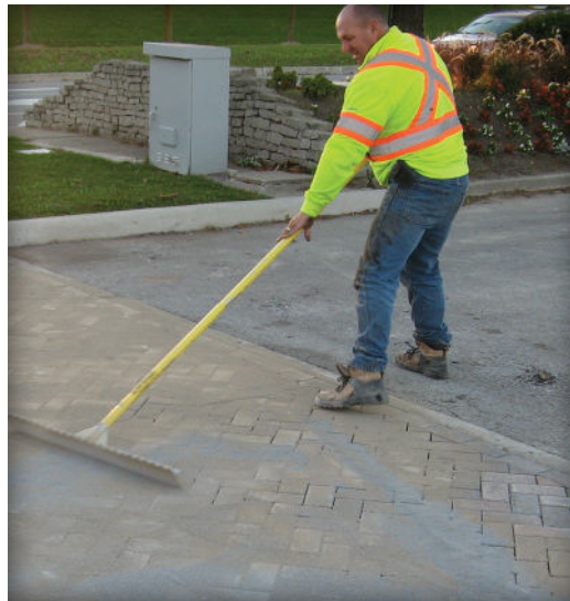
Figure 11. Sweeping in joint sand

Should the surface of the pavers be stained with adhesive during installation, it is very difficult to remove and fresh replacement pavers are required. In-service reinstatement of