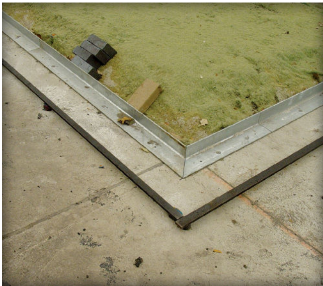
Figure 17. On larger projects, thick steel screed bars are placed on the concrete base to ensure a uniform bitumen-sand bedding thickness.