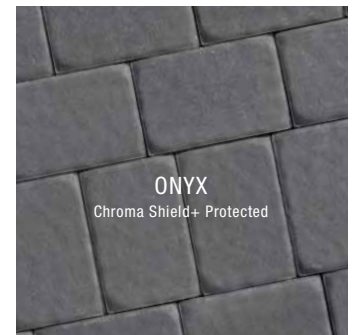
ONYX Chroma Shield+ Protected