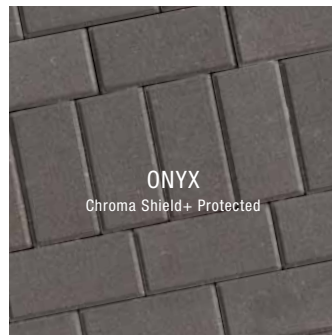
ONYX Chroma Shield+ Protected