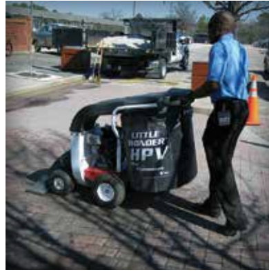
Figure 18. Walk-behind vacuum cleans a small parking area.