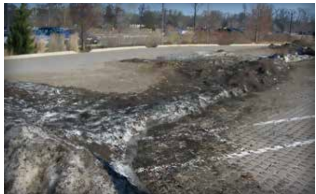
Figure 26. This is an example of snow that should have been deposited on a grassy area. If such areas are not available, then vacuum clean the PICP in the early spring.

Snow Removal —Unlike other permeable pavement surfaces, PICP demonstrates durability in the winter. PICP can be plowed with steel or hard rubber blades. Steel blades typically scratch all pavement surfaces. When using commercial snow removal companies, confirm in writing they provide protective edges on the snowplow equipment to avoid scratching the surface. Most pavers have chamfers on their surface edges which can help protect the edges from chipping by snow plows. For smaller areas, use a plastic snow shovel and fit snow blowers with plastic on the scoops and on the gliders. When possible deposit plowed snow onto grassy areas and not on the PICP when the plowed snow is dirty. Such dirt will remain and likely help clog the PICP surface after the snow melts.