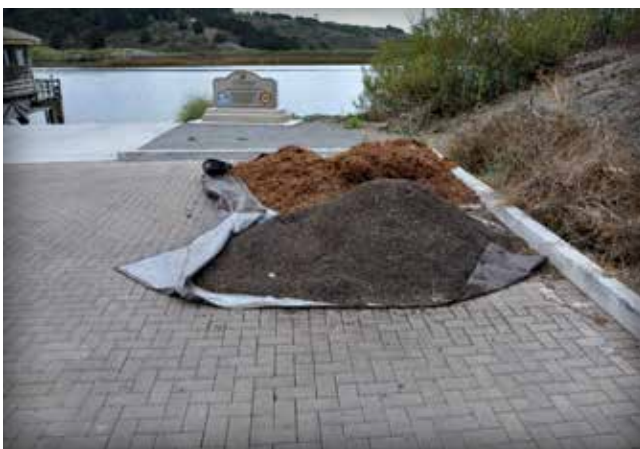
Figure 5. Mulch placed on tarps prevents more expensive cleaning of PICP.

Manage mulch, topsoil and winter sand. Finally, stockpiling mulch or topsoil on tarps or on other surfaces during site maintenance activities rather than directly on the PICP