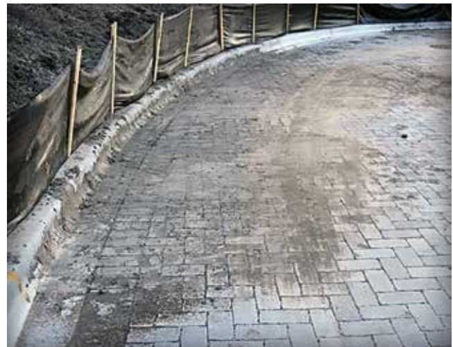
Figure 3. Whether eroded onto or dumped on PICP, erosion and sediment control are essential during construction.

Maintain filled joints with stones. The jointing stones capture sediment at the surface so it can easily be removed. If sediment is allowed to settle and consolidate, then cleaning becomes more difficult since the sediment is inside the joint rather than on the surface. Settlement of