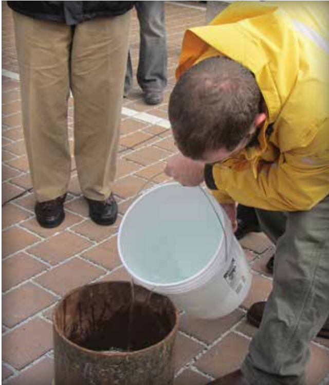
Figure 13. ASTM C1781: pouring the water into a 12 in. (300 mm) inside diameter ring set on plumber's putty.

ASTM C1781 test method begins with “pre-wetting” an area inside the ring to ensure the surface and materials beneath are wet. This is done by slowly pouring 8 lbs (3.6 kg) of water while not allowing the head of water on the paver surface to exceed \frac{3}{8} in. (10 mm) depth. If the time to infiltrate 8 lbs of water is less than 30 seconds (using a stopwatch typically on a cell phone), the subsequent test is done using 40 lbs (18 kg) of water. If more than 30 seconds, then 8 lbs of water is used in the subsequent tests. Again, a \frac{3}{8} in. (10 mm) head is maintained during the pour while being timed with a stopwatch. The surface infiltration rate is calculated using formulas in the test method.