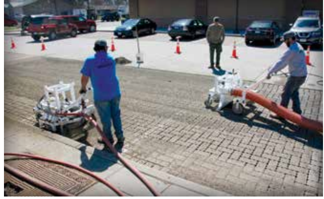
Figure 24. This equipment blows sediment and soiled aggregate from the joints and uses vacuum equipment to remove them.